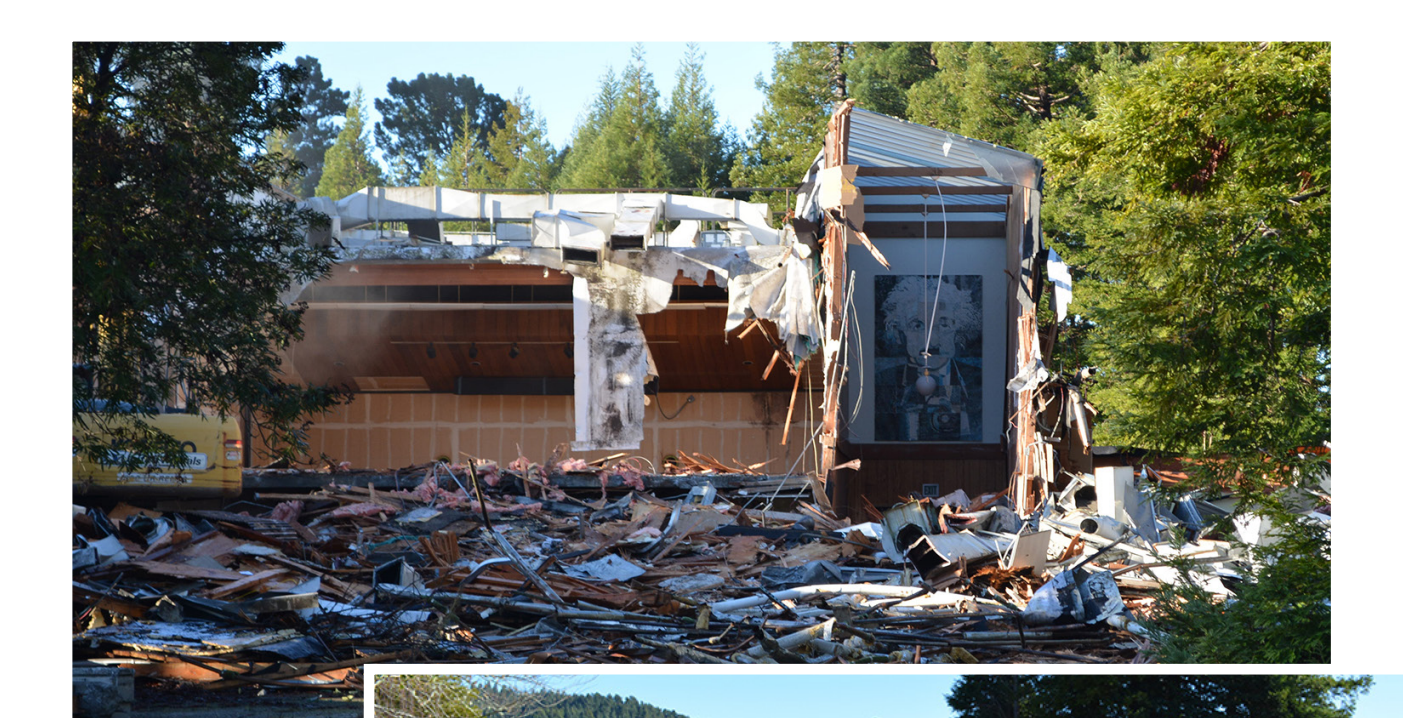
ABOVE AND RIGHT: Demolition of the old Life and Physical Science Buildings