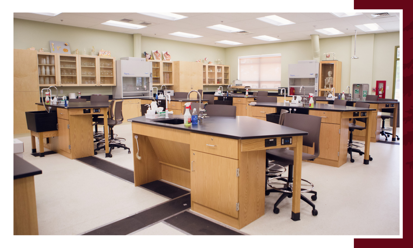
Del Norte Campus